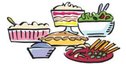
Covered Dish Luncheon

The Board of Congregational Life is sponsoring a covered dish lunch . Plan to bring a favorite dish to share with family and friends as we enjoy lunch together immediately following the worship service. ( NOTE: Members of Women's Life Fellowship will be in the kitchen before and after Sunday school to assist those who need to put food in the refrigerator.)