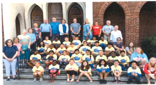
The campers and staff of Arts Discovery Camp 2019

What an experience we had at camp! Thank you for assistance. We are truly grateful for your help!