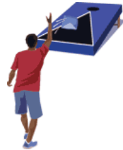
Games & Prizes

Sponsored by the following churches: First United Methodist, First Presbyterian, First Baptist, First Reformed UCC and Grace Episcopal