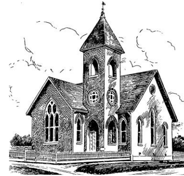
1901 The First Church