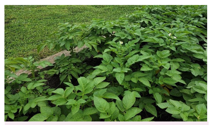
Volunteers are needed to work in the First Reformed UCC Community Garden on Saturday, May 28 from 10 AM - 12 PM.

For more information contact Edgar Miller at 366-688-2651